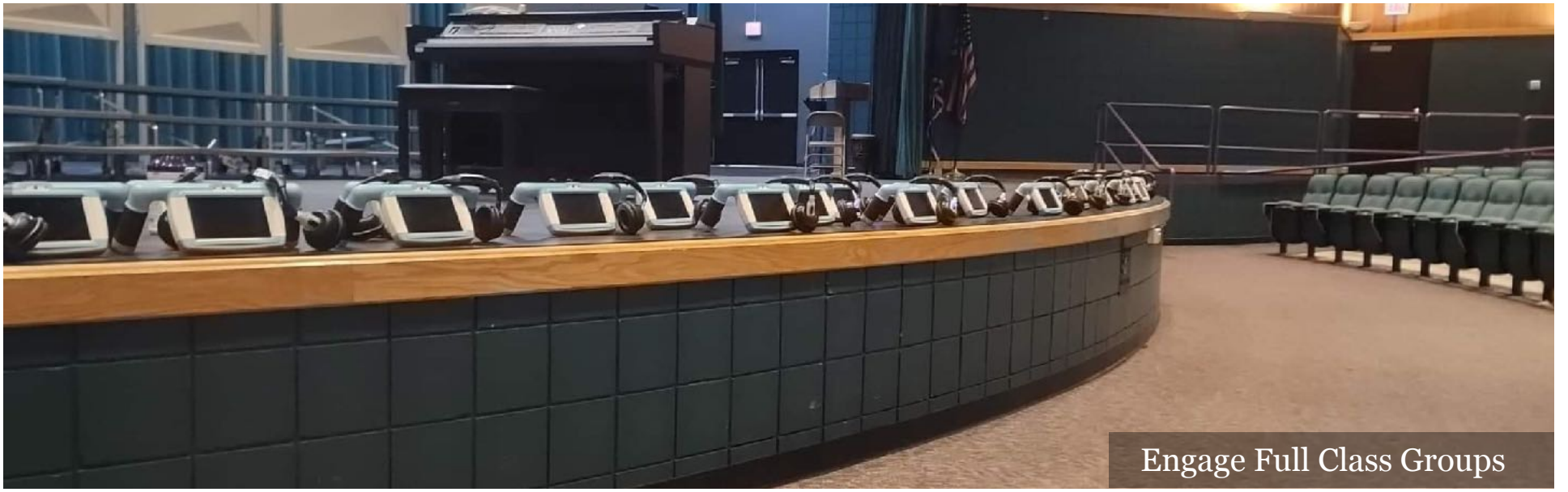
Engage Full Class Groups