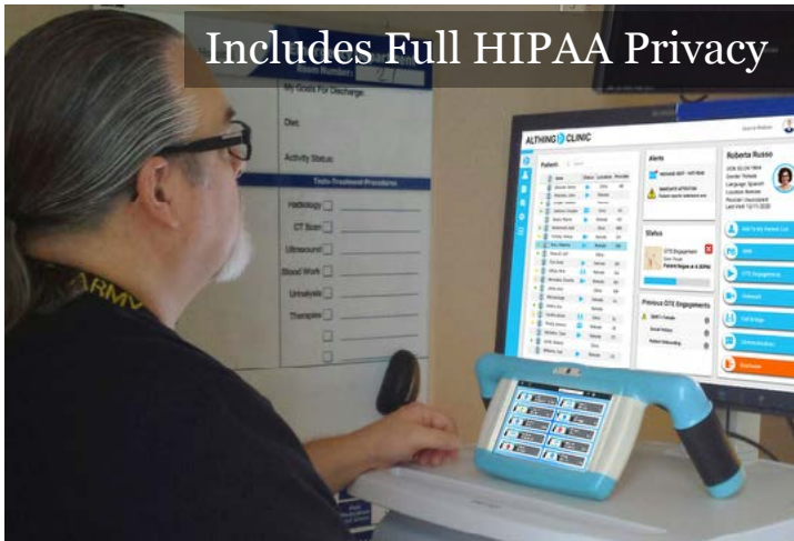
Includes Full HIPAA Privacy